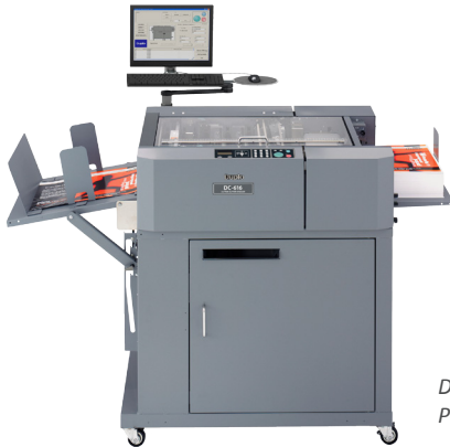
DC-616 PRO standard with PC Controller software